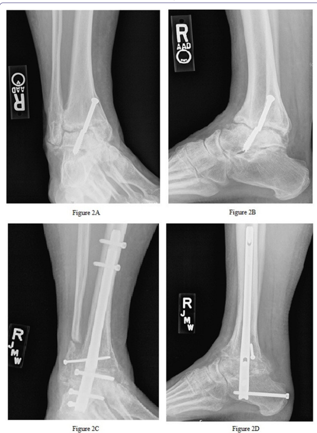
Figure 2: A (mortise) and B (lateral) are pre-operative images of patient 3 demonstrating ankle nonunion with anterior translation, subtalar joint arthritis, broken hardware. C (mortise) and D (lateral) are post-operative images demonstrating solid union at the ankle and subtalar joints, as well as the fibula onlay site.

The patients underwent a variety of surgical treatments. Nonunion of previous arthrodesis or of fracture or revision of failed prior surgery was the indication for 5 patients (50%) (Figures 2 and 3). A total of 23 fusion sites were represented in the study population. Adjunctive procedures were performed in 7 patients (70%). Autogenous grafting was utilized in 3 patients (30%) and BMA was used in 5 patients (50%). A detailed list of surgical variables is listed in table 2.