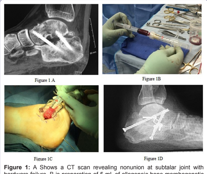
Figure 1: A Shows a CT scan revealing nonunion at subtalar joint with hardware failure. B is preparation of 5 mL of allogeneic bone morphogenetic protein granules being mixed with 6 mL of bone marrow aspirate. C shows delivery of grafting materials into the nonunion site. D is a weight bearing lateral plain radiograph at 3 months post-operatively showing solid arthodesis with alternative hardware placement.

whether primary arthrodesis, revision of arthrodesis nonunion, or fracture nonunion. In all cases, the proposed fusion site was exposed, and any remaining articular surface was removed past subchondral bone. For nonunion, this included debridement of fibrotic material to raw, bleeding bone. The area was then fenestrated with small drill or pin. Once the arthrodesis site was prepared, it was packed with AMP and any other grafting material used. Fixation was specific to the anatomic site, but in all cases was meant to provide compression and stability. Forefoot cases were allowed to weight bear in a protective boot at 2 weeks, while all midfoot, hindfoot, and ankle cases were restricted to a non weight bearing splint and then fiberglass cast for 6-8 weeks (Figure 1).