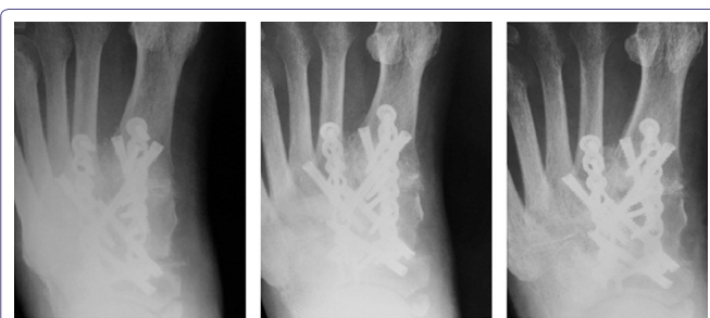
Figure 4: New bone growth is demonstrated in patient 7. AP image two weeks post-operative (A) shows open joints at the 1st tarsometatarsal and medial naviculocuneiform. AP image at 48 days post-operative (B) shows solid arthrodesis at those joints. AP image at 139 days post-operative (C) demonstrates new bone growth at the 1st interspace between the 1st and 2nd metatarsal base.

In conclusion, AMP is found to have similar outcomes as would be expected for other studied bone graft materials. It is difficult to draw firm conclusions based on this early evaluation due to the stated limitations. However, no graft specific adverse reactions were identified. There are several practical advantages to the current product, and further study was deemed warranted. Based on these findings, the authors are collecting further data to address several of this limitations. Advanced biologics such as the one explored in this work continue to show great promise and utility in foot and ankle