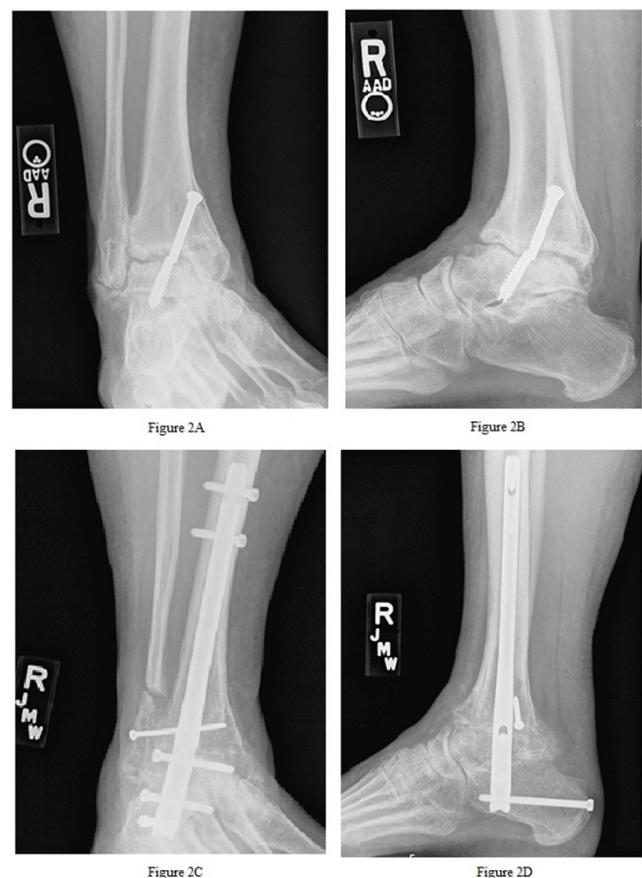
Figure 2: A (mortise) and B (lateral) are pre-operative images of patient 3 demonstrating ankle nonunion with anterior translation, subtalar joint arthritis, broken hardware. C (mortise) and D (lateral) are post-operative images demonstrating solid union at the ankle and subtalar joints, as well as the fibula onlay site.

The patients underwent a variety of surgical treatments. Nonunion of previous arthrodesis or of fracture or revision of failed prior surgery was the indication for 5 patients (50%) (Figures 2 and 3). A total of 23 fusion sites were represented in the study population. Adjunctive procedures were performed in 7 patients (70%). Autogenous grafting was utilized in 3 patients (30%) and BMA was used in 5 patients (50%). A detailed list of surgical variables is listed in table 2.